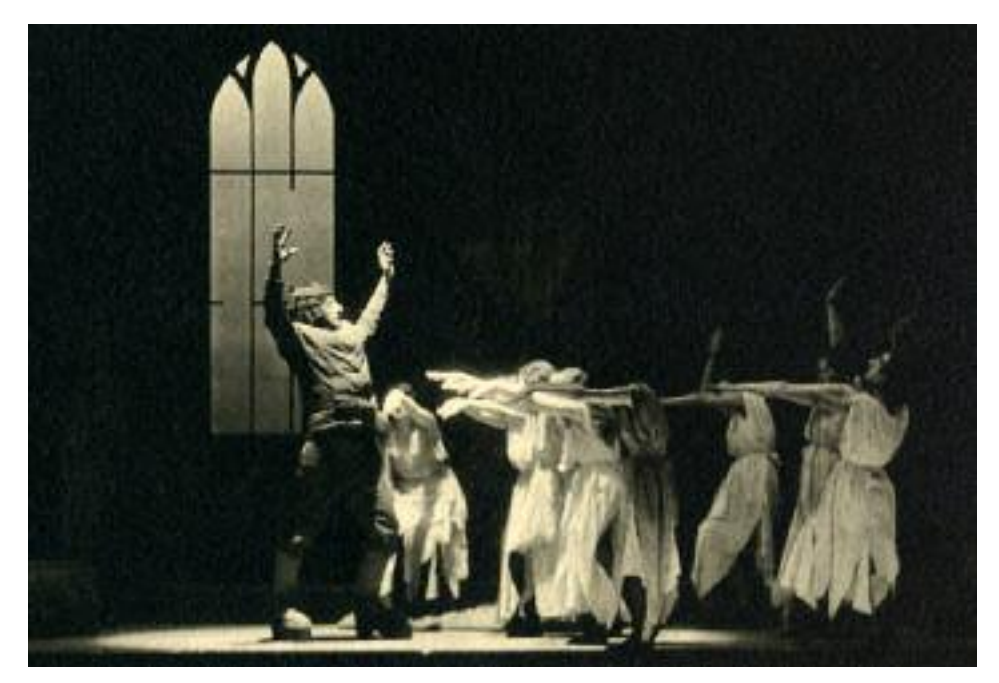
From The Golem, based on the dramatic poem by H. Leivick. Choreography by Nathan Vizonsky.

dance is extremely modernistic, but without modern coldness. It is the most gracious material for the revelation of the artistic personality.