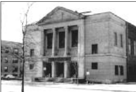
Independence Boulevard Seventh Day Adventist Church (formerly Anshe Sholom Synagogue).