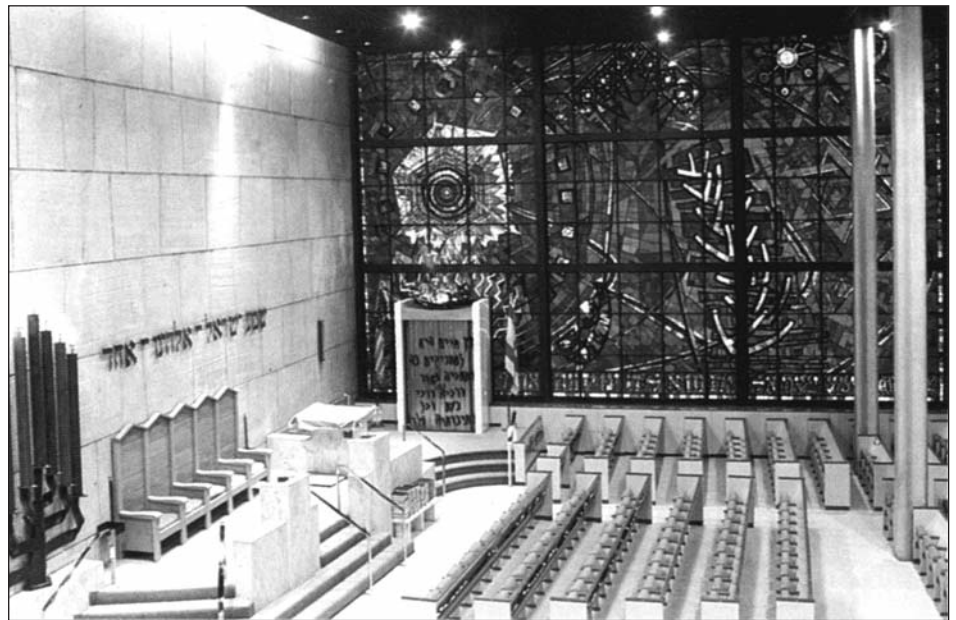
Sanctuary, Chicago Loop Synagogue. The stained glass window, “Let There Be Light,” was designed by Abraham Rattner; the Ark and Eternal Light are by Henri Azaz.

O nce LS&B received the Chicago Loop Synagogue commission and Bennett was named to head the design team, it was discovered that one problem with the previous design was getting the elderly congregants up to the second floor sanctuary without climbing stairs. Bennett—who referred to himself as a goy —