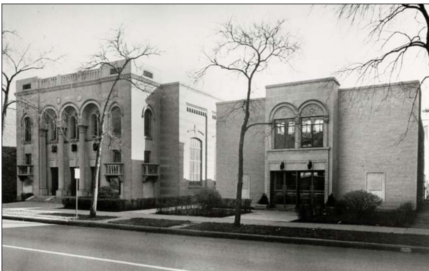
B'nai Israel of Austin and Addition, 5433 West Jackson Blvd.

Editor's note: The boys and girls of the JYL may have attended weekend seminars and/or summer sessions at Camp Sharon at Clear Lake, near Buchanan, Michigan. The camp was sponsored by the College of Jewish Studies from 1946 to 1964. Camp Sharon featured the serious study of Jewish culture in the Hebrew language, taught by respected scholars.