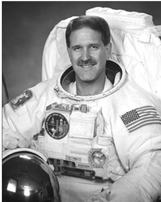
Astronaut John Mace Grunsfeld, Ph.D.