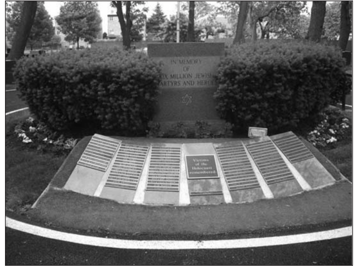
Holocaust Memorial, New Light Cemetery.

initiation fee is levied on the applicant upon acceptance of his/her/their membership application. There are presently about four hundred paying single and family members making up the Association. Burial rights at New Light cemetery are available only to members of the Association.