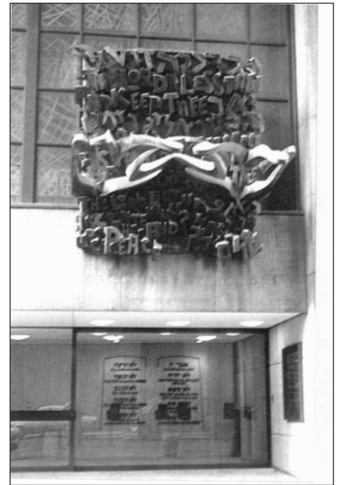
Entrance, Chicago Loop Synagogue.

Three additional problems encountered by Bennett were the floor covering of the main sanctuary (cost), the storage of religious books (space), and the door handles of the Holy Ark (weight). His solutions: the sanctuary floor was covered with linoleum cut and laid to resemble marble. Storage of prayerbooks was solved by making pockets in the chair backs. When the older men of the congregation found that they could not manage the heavy handles of the Ark doors, Bennett designed handles that worked on a track system that made opening and closing the doors relatively easy.