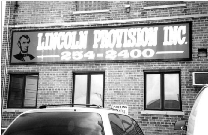
Lincoln Provision Inc., 824 West 38th Place, Chicago.