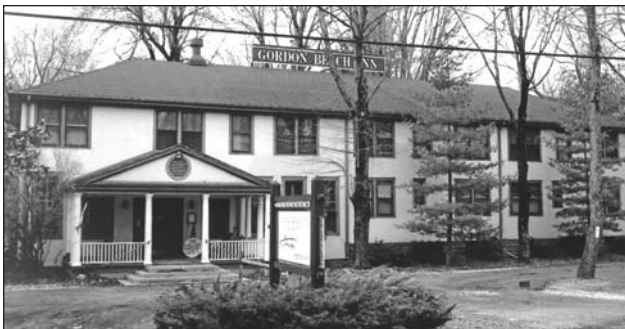
Gordon Beach Inn, Union Pier, Michigan.

Article begins on page 10.