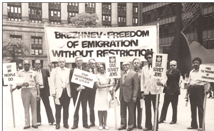
Chicago's labor leaders at the Vigil for Soviet Jewry, Civic Center Plaza, 1973.