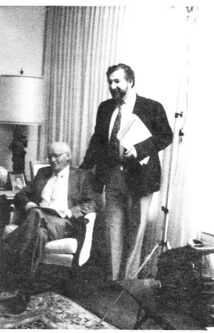
Hillel Center, which is currently open to the public as well as UIC students, is located at 929 South Morgan Street.