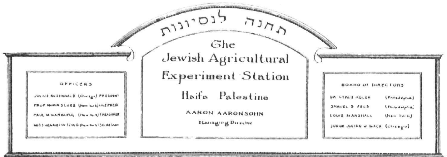
The letterhead of the agricultural experiment station near Haifa which Aaron Aaronsohn convinced "non-Zionist" Julius Rosenwald to head and support for many years. Note names of other prominent American supporters.

rather rudely to Rosenwald from Washington on December 21, 1917: