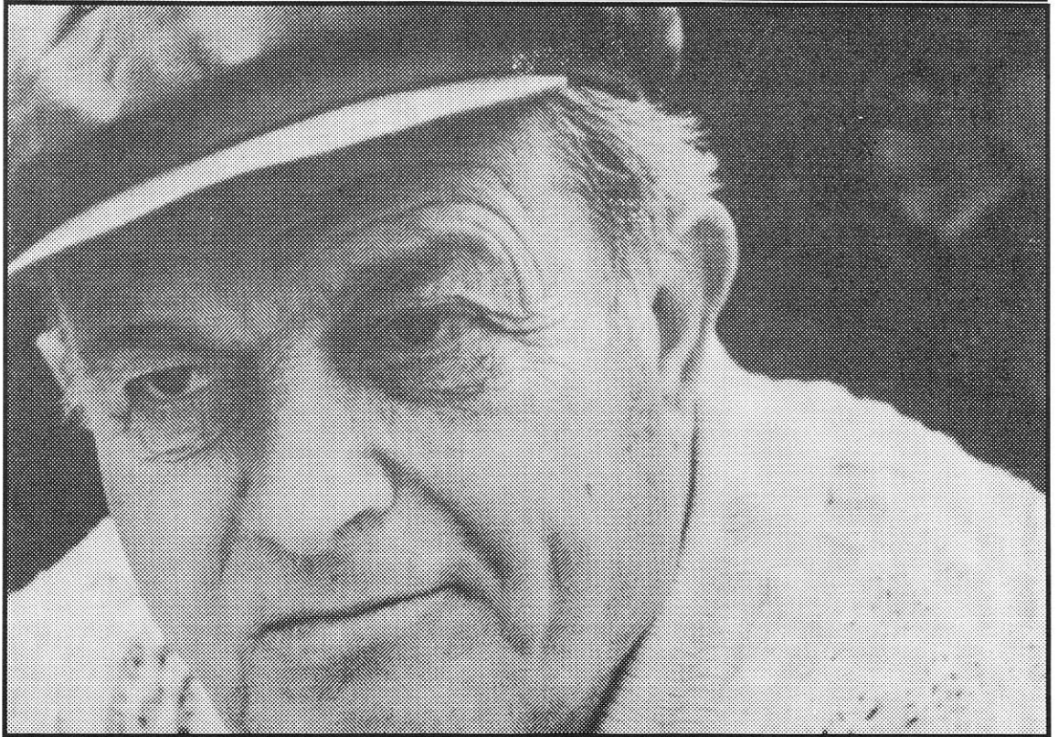
Meyer Levin, circa 1980