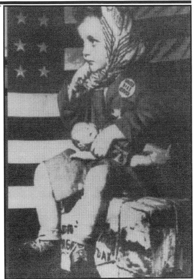
One of the countless Immigrants Assisted by HIAS

Behind the history of HIAS are the individual stories of