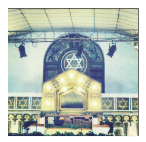
Greater Galilee M.B. Church.

The tour bus had proceeded from the Loop to the Near West Side, where the Maxwell Street Market once flourished. Now a Sunday-only flea market on South Desplaines Street offers Latino food specialties. University Village, the UIC development, has replaced the once teeming immigrant enclave and the former ethnic neighborhoods. The West Side boulevards took us through Douglas Park and Lawndale, past former synagogues and the former JPI, past the original Sears Tower in the massive former mail order complex, Gregory Elementary School, Marshall High, and the Garfield Park Conservatory. — B.C.