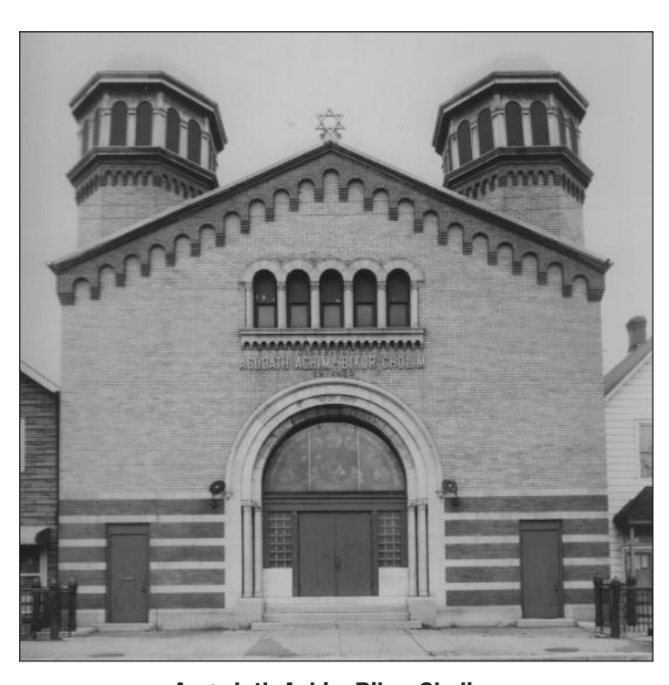
Augudath Achim-Bikur Cholim. 8927 South Houston Avenue (3000 East). Since 2004 it has been home to Christ Life Church.