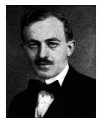
Ben Hecht in 1924 photograph from the book History of the Jews of Chicago; published by the Jewish Historical Society of Illinois, 1924

B en Hecht has been characterized as the most prolific multimedia writer of the 20th century, leaving behind after his death in 1964 eight novels, hundreds of short stories, memoirs, plays, two literary magazines and screenplays for over 70 Hollywood films.