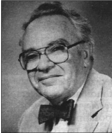
Martin D. Kamen. Program, 1995 Enrico Fermi Award Ceremony.

In Radiant Science, Dark Politics: A Memoir of the Nuclear Age (University of California Press, 1985), Kamen describes his Jewish boyhood: "The only objects of prejudice were the blacks across Cottage Grove Avenue to the West, who were perceived a threat to economic well-being and hopes of future prosperity by the whites in the eastern portion of Hyde Park."