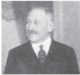
The late Chicago philanthropist Julius Rosenwald, part owner of Sears, Roebuck and Company

C JH is pleased to report that a national park named in honor of the late Chicago Jewish philanthropist Julius Rosenwald, the part owner of Sears, Roebuck and