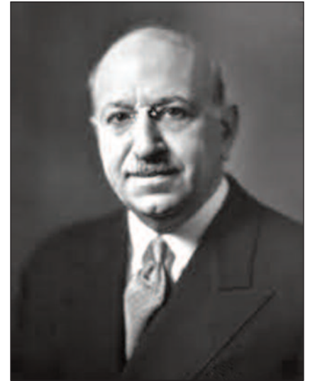
Henry Horner (1878-1940).

The future governor would be a lifelong bachelor who enjoyed the conviviality of the Standard Club, good whiskey, and a fine cigar. He was a member of two Reform congregations, Sinai and Kehilath Anshe Maariv (KAM). Throughout his career Henry Horner was extremely sensitive about the integrity of the Jewish community. For example, when Jewish merchants who supplied state institutions tried to hedge on their contractual obligations or substitute inferior merchandise for the original, his wrath was boundless. He would rage, “You have disgraced me and